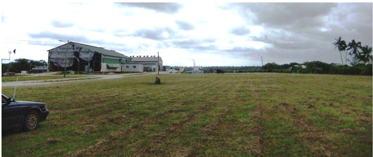
Figure 4 – Proposed solar farm site looking southwest towards Popua Diesel Generation facility

The gravity based design of the foundations will comprise of concrete blocks placed on the surface of the site. Concrete will be sourced from local contractors and the construction operator will employ a small local labour force (approximately 15 personnel). The solar modules, racking system, electrical inverters, transformers and electric cabling will be sourced from overseas. The solar manufacturers enforce strict environmental standards during manufacturing. The solar farm components are composed of non-toxic materials and are easily removed after the life of the project.