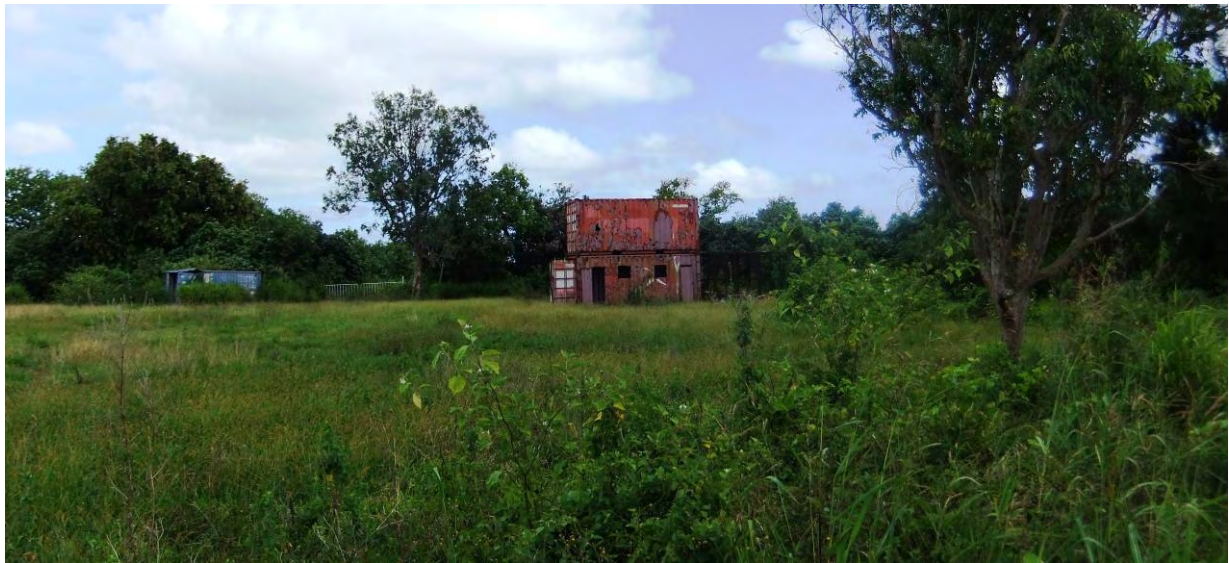
Figure 6 – Proposed solar farm site behind Maritime School – looking northeast