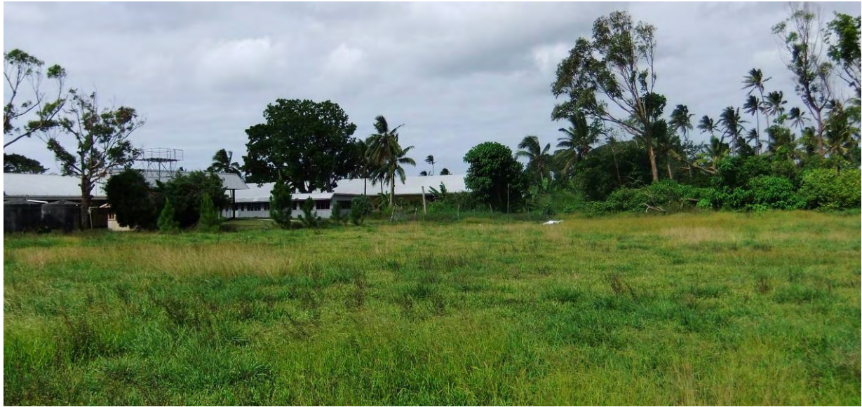
Figure 7 – Proposed solar farm site looking north towards Maritime School buildings