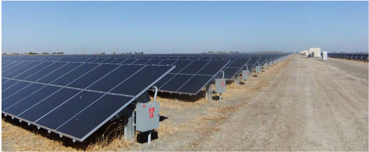
Figure 1 – Meridian’s 5MW CaIRENEW-1 Solar Farm in Mendota, California