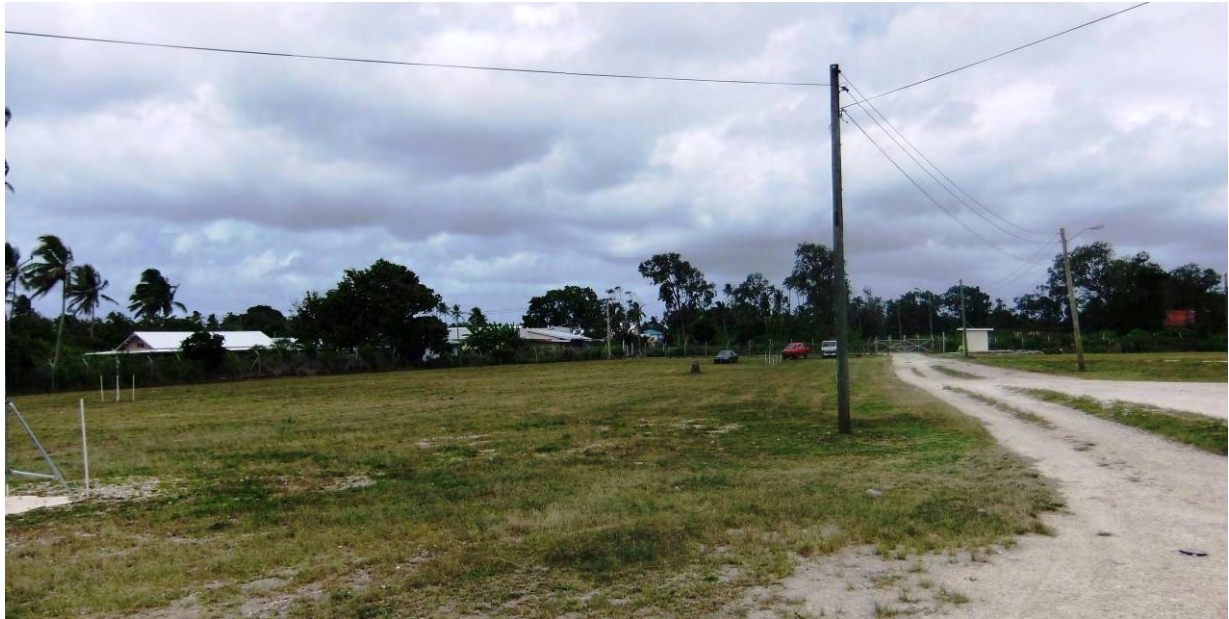
Figure 5 – Proposed solar farm site looking northeast towards security hut and Maritime School