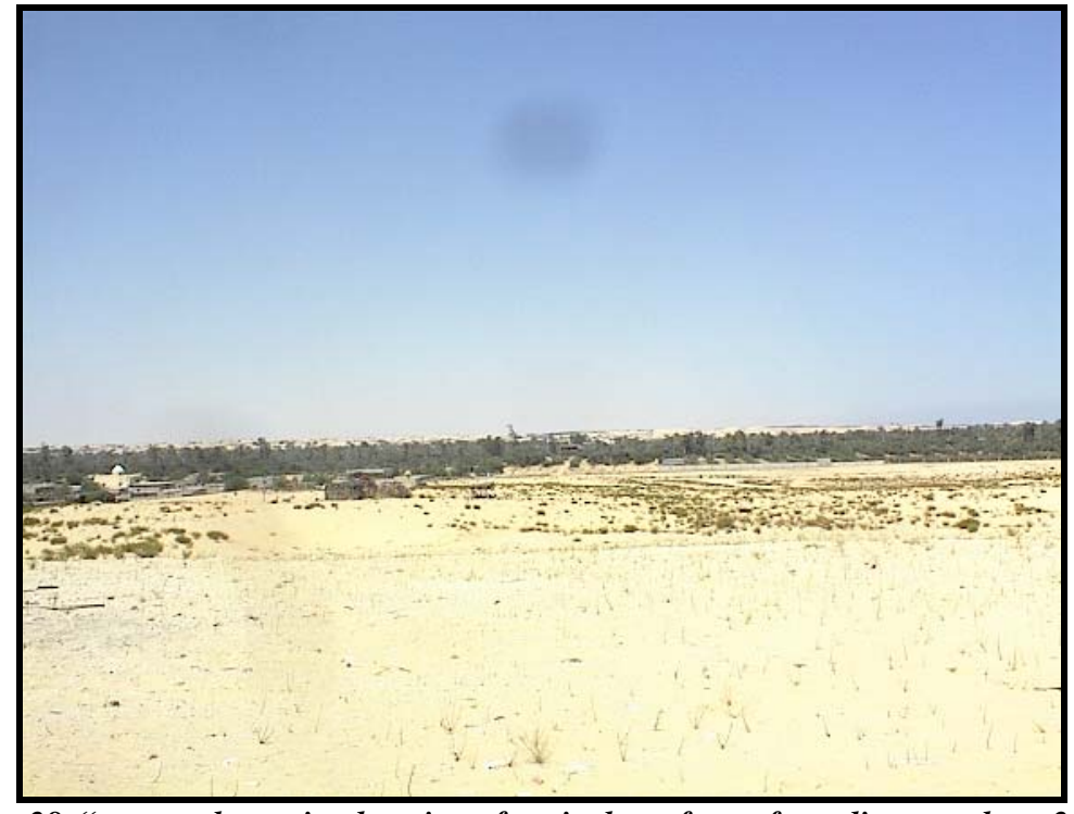
Photo 28 "proposed crossing location of agriculture farms for a distance about 2 KM"