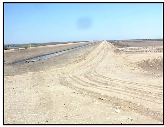
Photo 8, 9, &10 "proposed crossing of the canal branch no1, 3, and 5 from El-Sheikh Gaber canal and the parallel small roads"