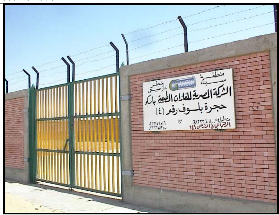
Photo 19 "Start point of Loop 2 of the proposed pipeline, showing valve room No 4 at Bair El-Abd along the existed pipeline route"