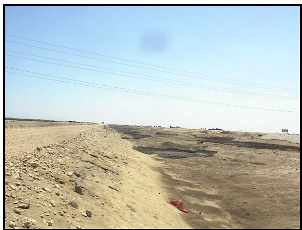
Photos 6&7 "The proposed pipeline route parallel to El-Sheikh Gaber canal for about 18 km"