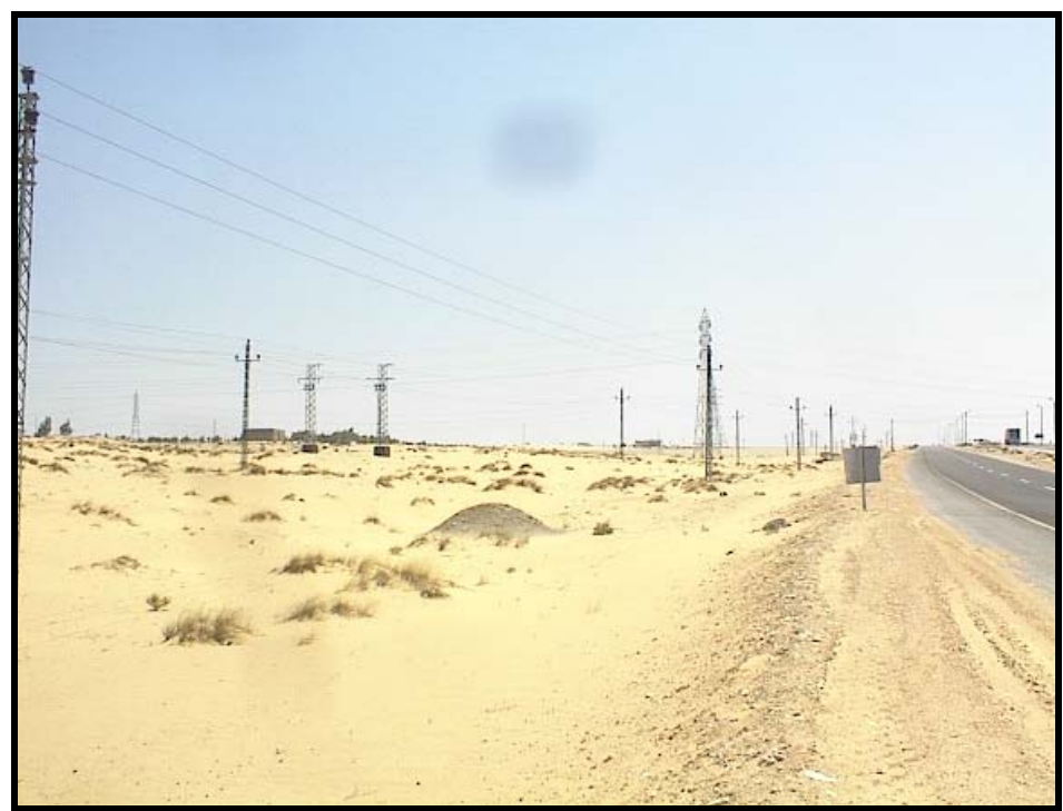
Photos 15, 16 "El-Qantara – El-Areish road parallel to the proposed pipeline from the north direction behind Romana village on the road"