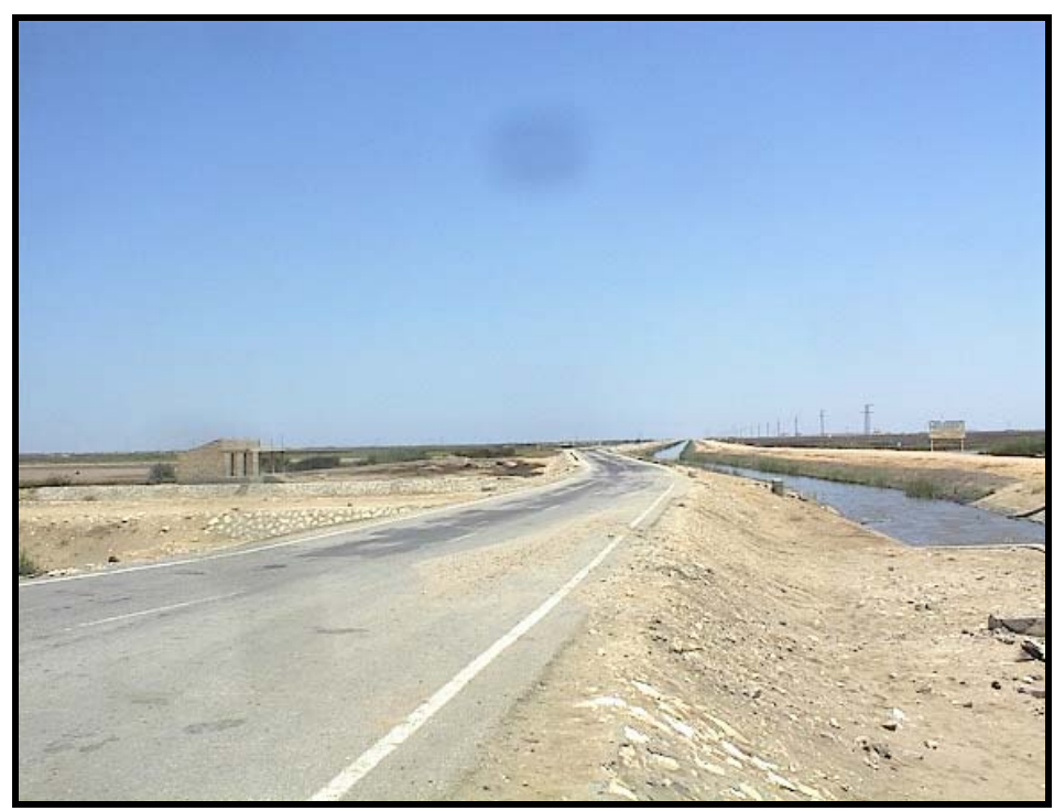
Photo 11 "proposed crossing of the canal branch no7 from El-Sheikh Gaber canal and the parallel small road