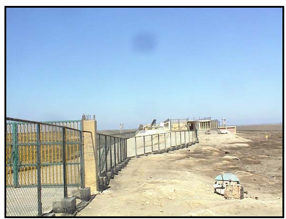
Photo 1 "Start Point of the proposed pipeline from El El-Tena East existed valve room"