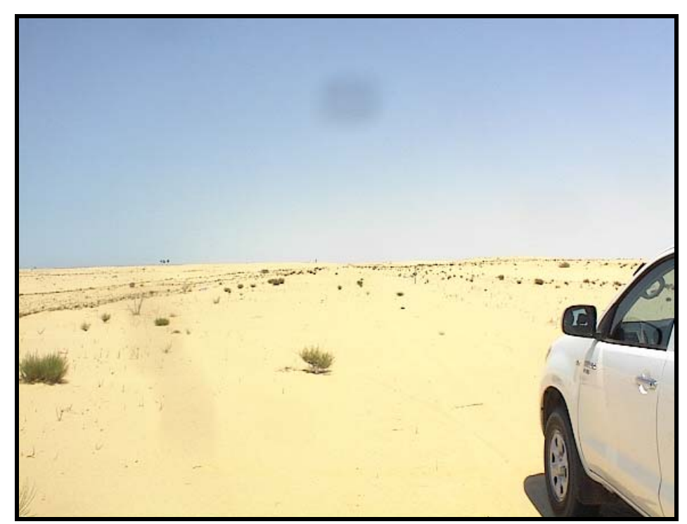
Photos 20 "proposed pipeline route parallel to the existed pipeline in the desert area 3 km South El-Qantara – El-Areish road"