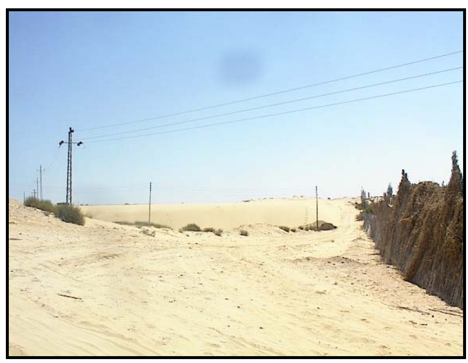
Photo 25, & 26 "proposed crossing location at El- Midan village and the Low voltage towers"