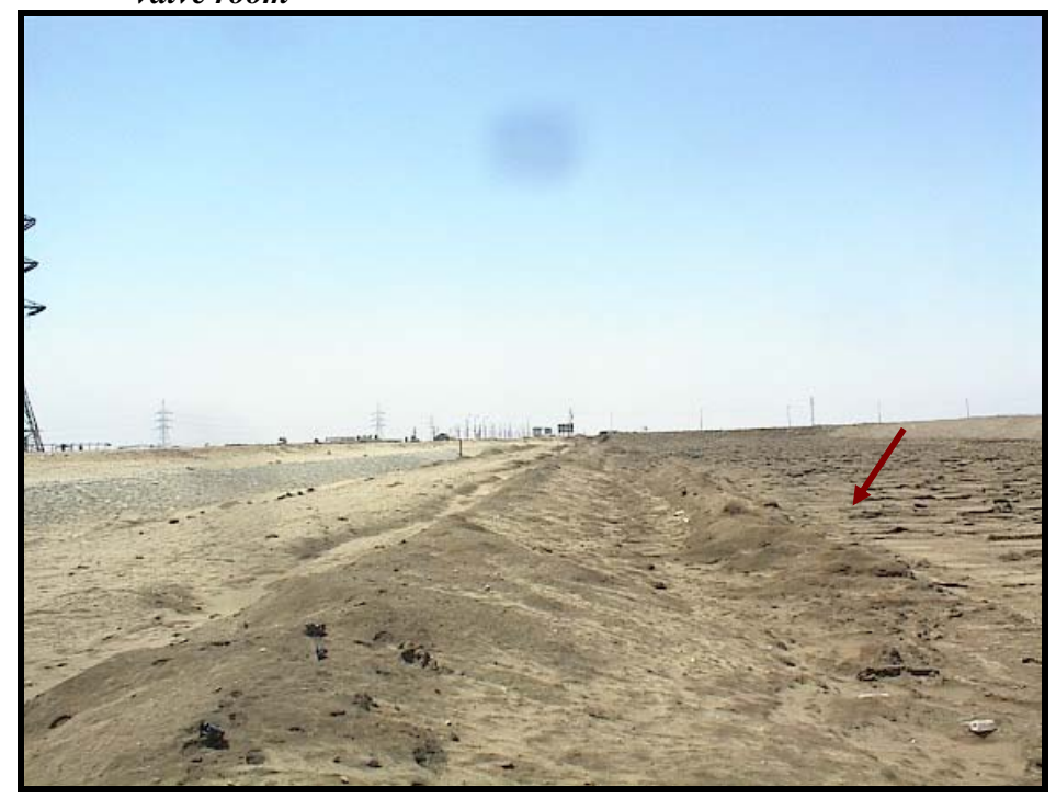
Photo 2 "The proposed pipeline route for 400 m parallel to the existed pipeline El-Tena East- Ouen Mousa"