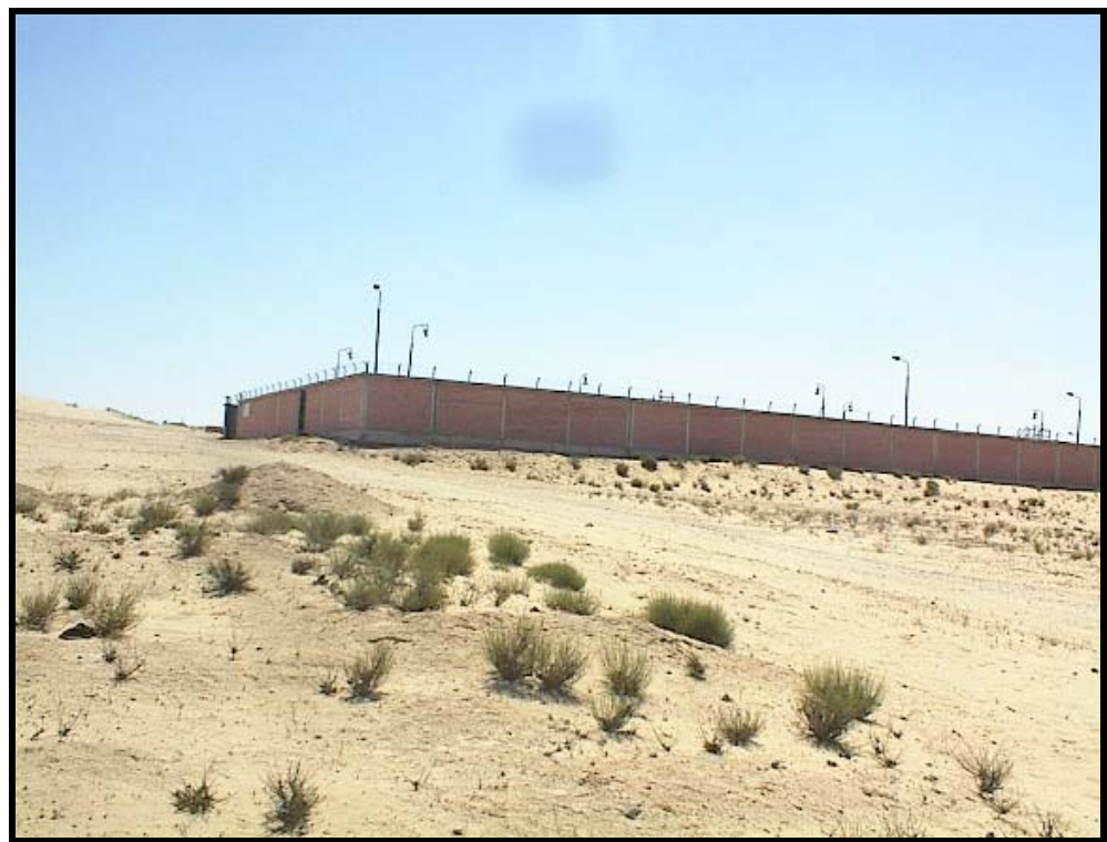
Photos 29, & 30 "End point of Loop 2 of the proposed Abr Sinai pipeline"