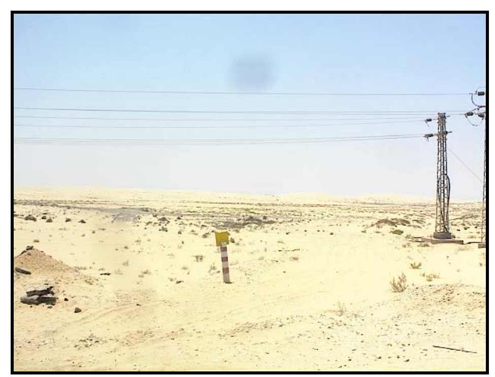
Photo 17 "the proposed pipeline parallel to the existed Abr Sinai old pipeline"