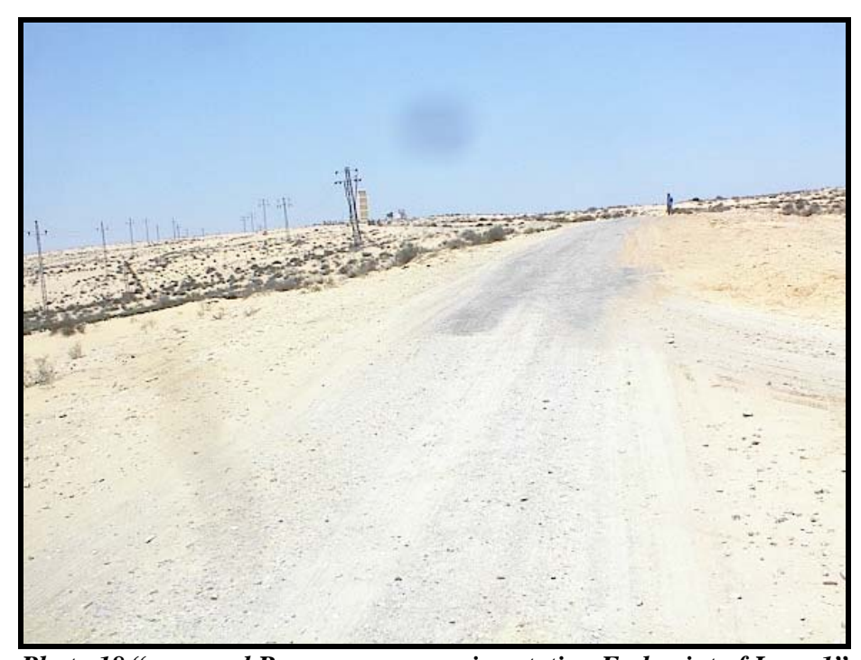
Photo 18 "proposed Romana compressing station End point of Loop 1"