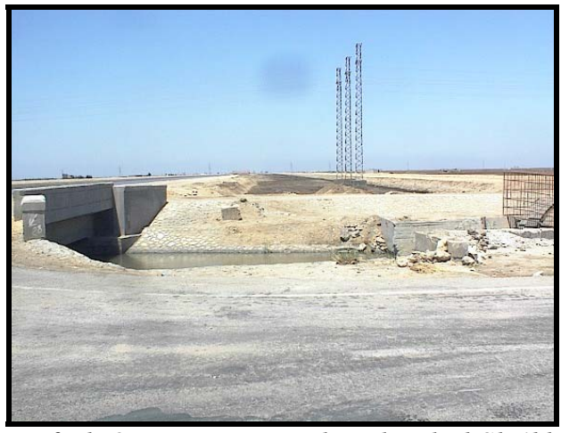
Photos 4&5 "proposed crossing location of El- Qantara Port Foad road and El-Sheikh Gaber canal"