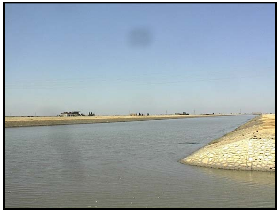
Photo 12 "El-Sheikh Gaber Canal parallel to the proposed pipeline"