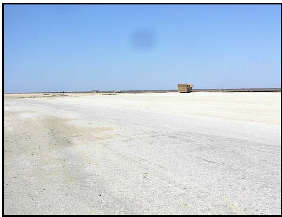
Photos 13, & 14 "proposed pipeline crossing of the old temporary airstrip. parallel to El-Sheikh Gaber Canal"