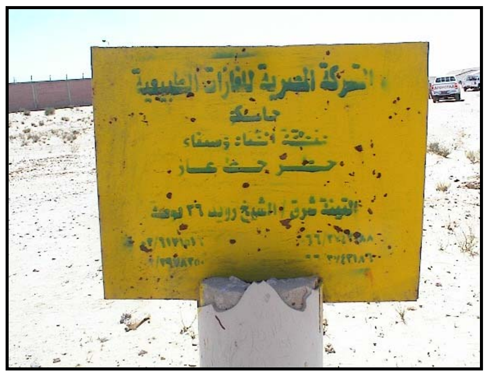
Photo 24 "Sign of the Existed pipeline parallel to Loop 2 part of the proposed pipeline route in the desert area 3 km South El-Qantara – El-Areish road"