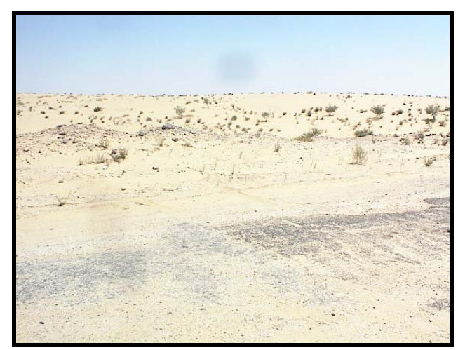
Photos 21, 22, &23 "proposed pipeline route parallel to the existed pipeline in the desert area 3 km South El-Qantara – El-Areish road"