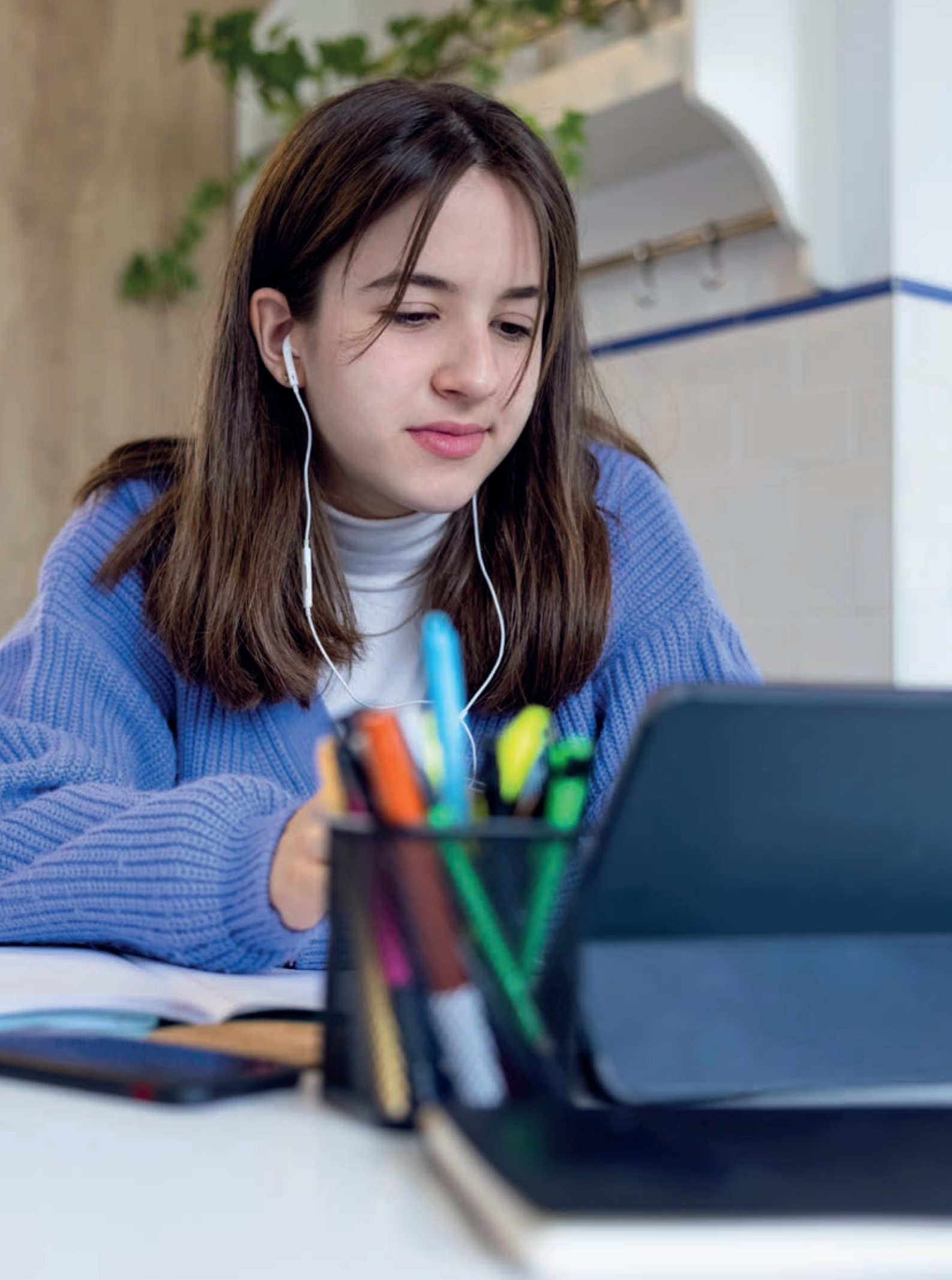
E-schools in Croatia.