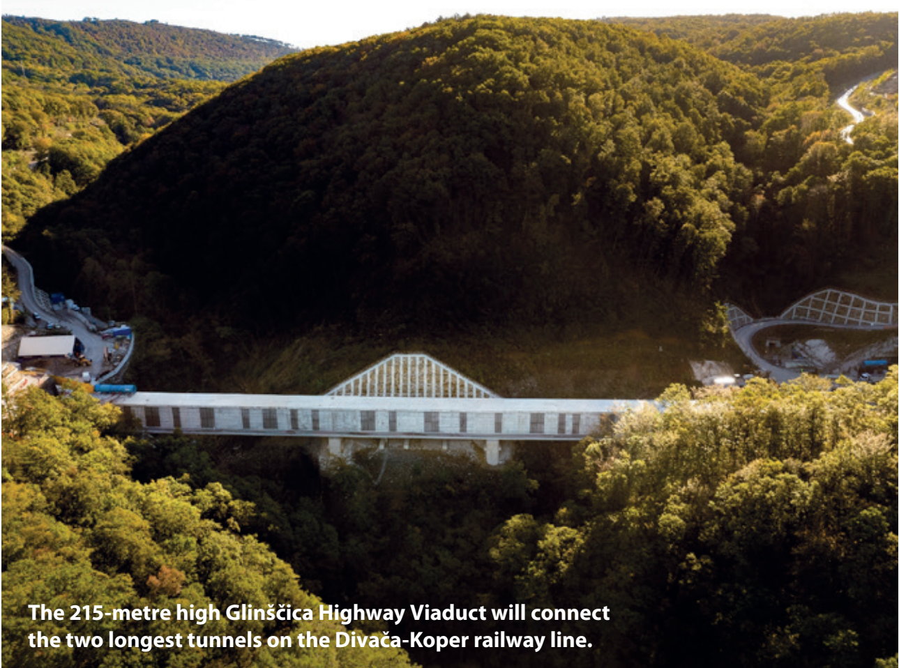
The 215-metre high Glinščica Highway Viaduct will connect the two longest tunnels on the Divača-Koper railway line.